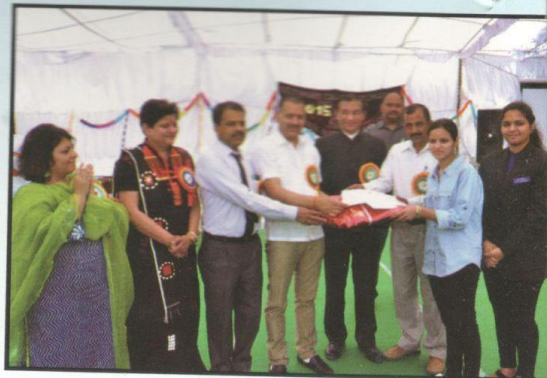
Gomati B.Sc.III 2nd Position in H.P.U (2015)