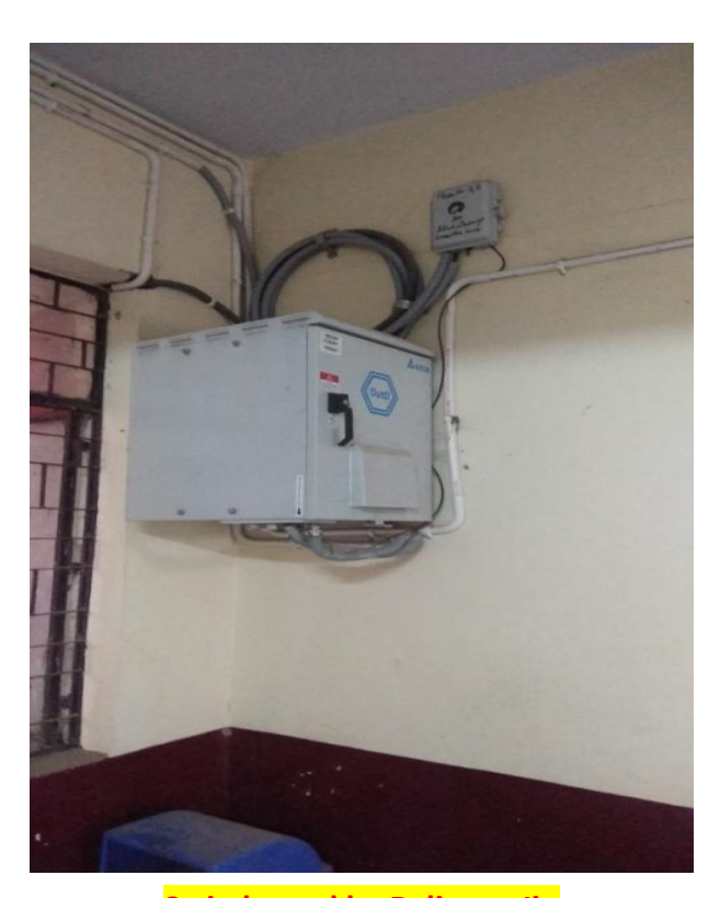
Switch used by Reliance Jio

This switch is provided by the Reliance JIO to provide Wi-Fi services within the campus.