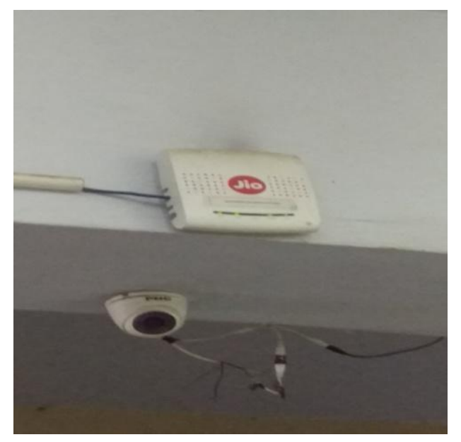
Router by Reliance Jio

This router is used to provide Wi-Fi services within campus. There are total 12 routers provided by the Reliance JIO.