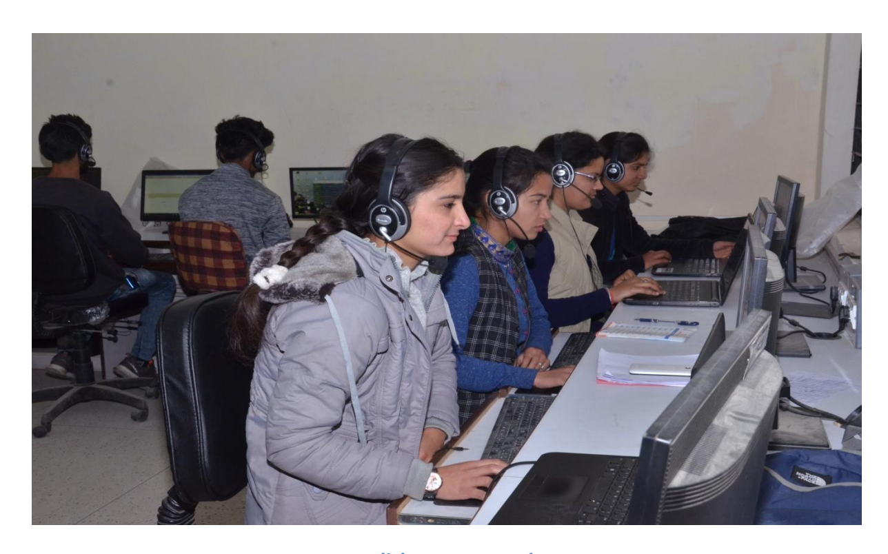
English Language Lab