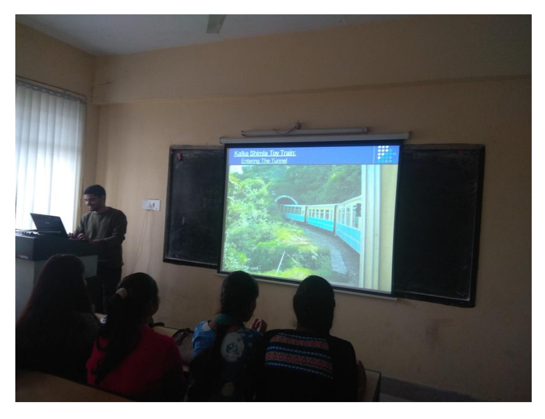
Tourism Dept. using ICT Facility