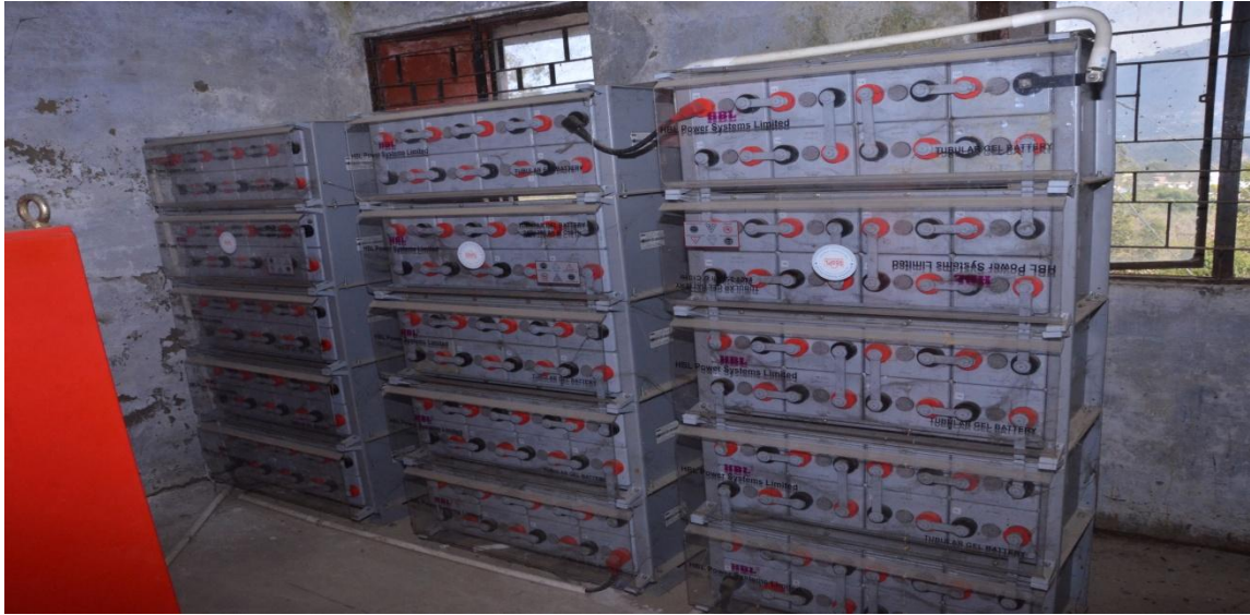
Solar Power Plant of 15 KWH