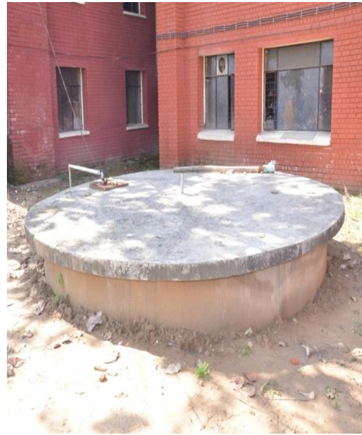
Construction of Platforms & Rain Water Harvesting Tank