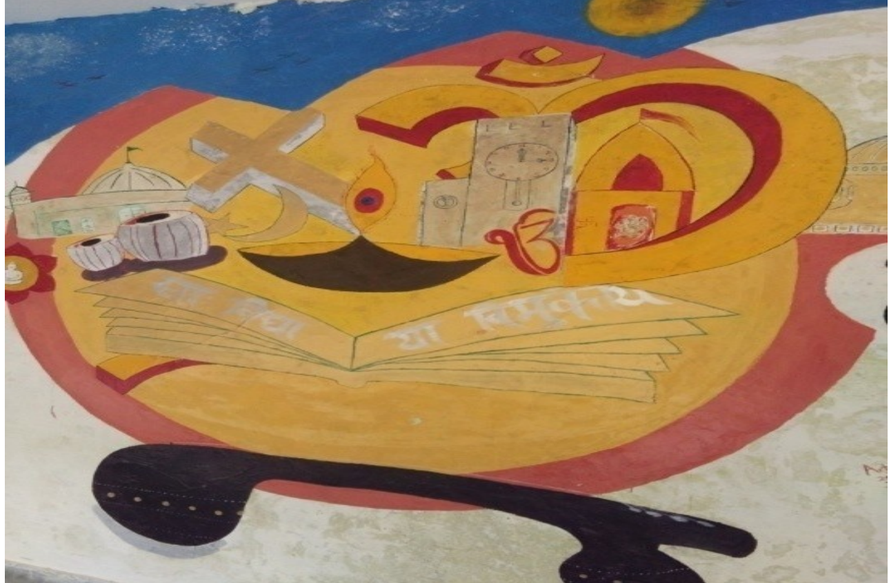
Figure 1 Wall Painting done during Communal harmony week celebration