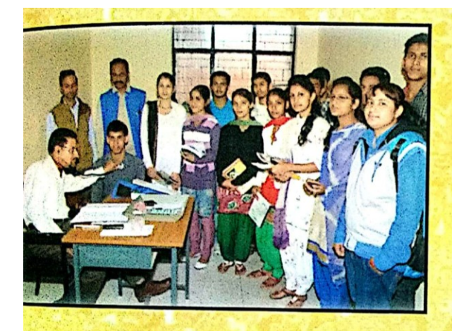
Medical Camp organized in the college by NSS