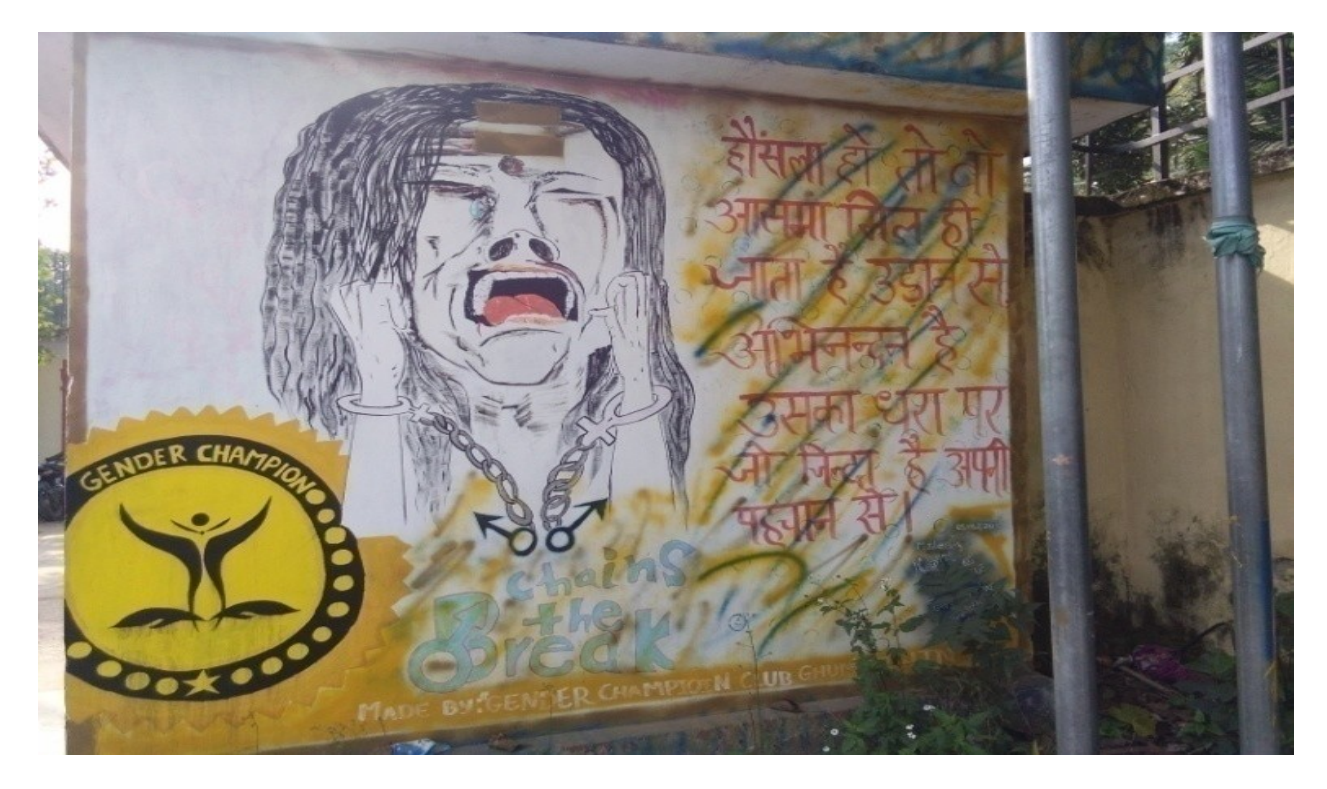
Figure 3 Wall Painting by College Students