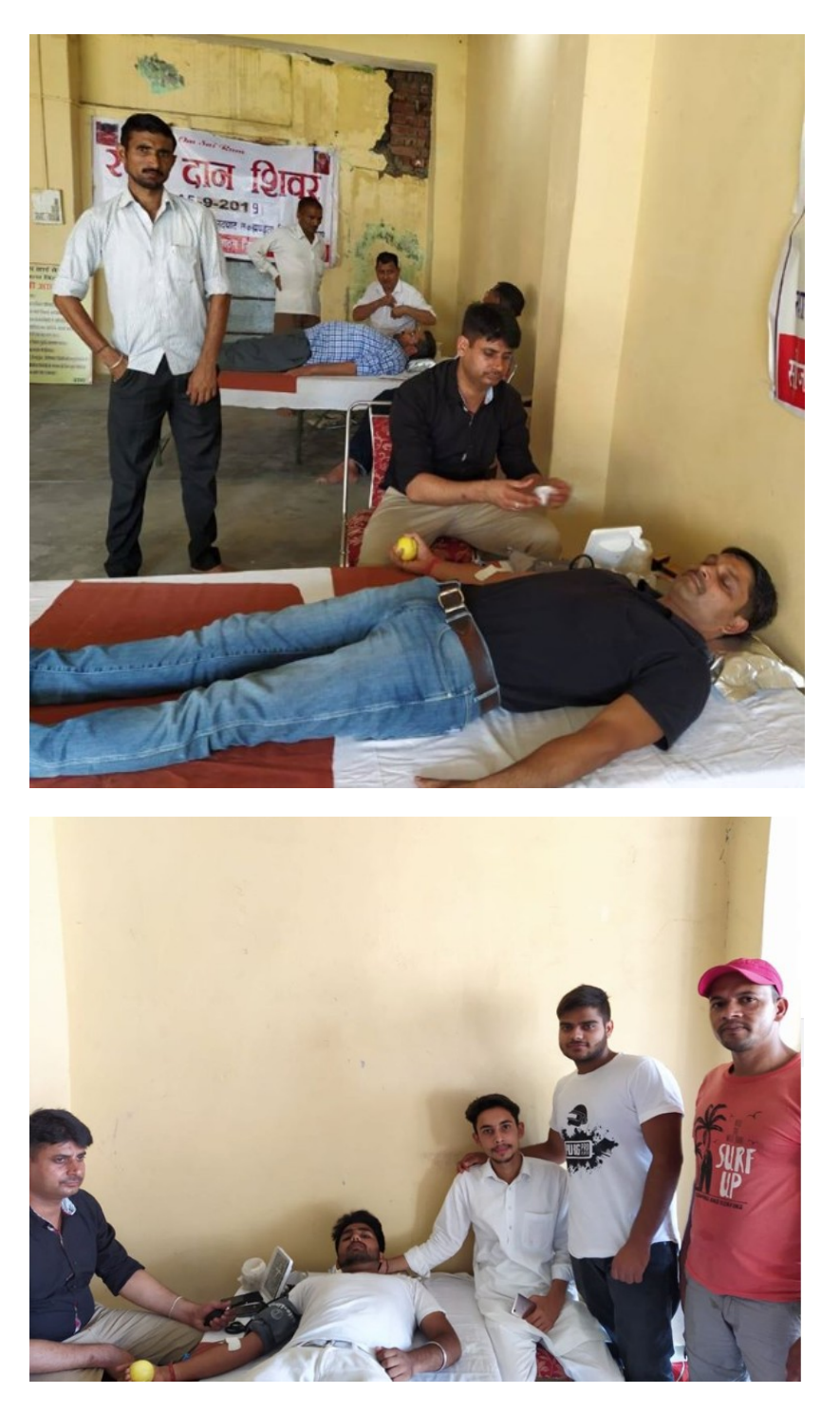
Figure 3 Blood Donation Camp