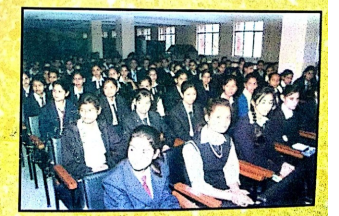
Students of self-financing courses attentivety listening to experts on one day seminar.