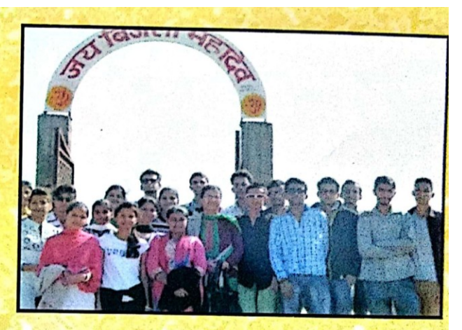
Students of Physics (Major) during their Education trip