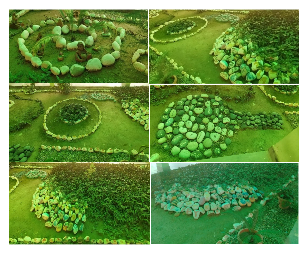
Figure 1 Stone art by college students