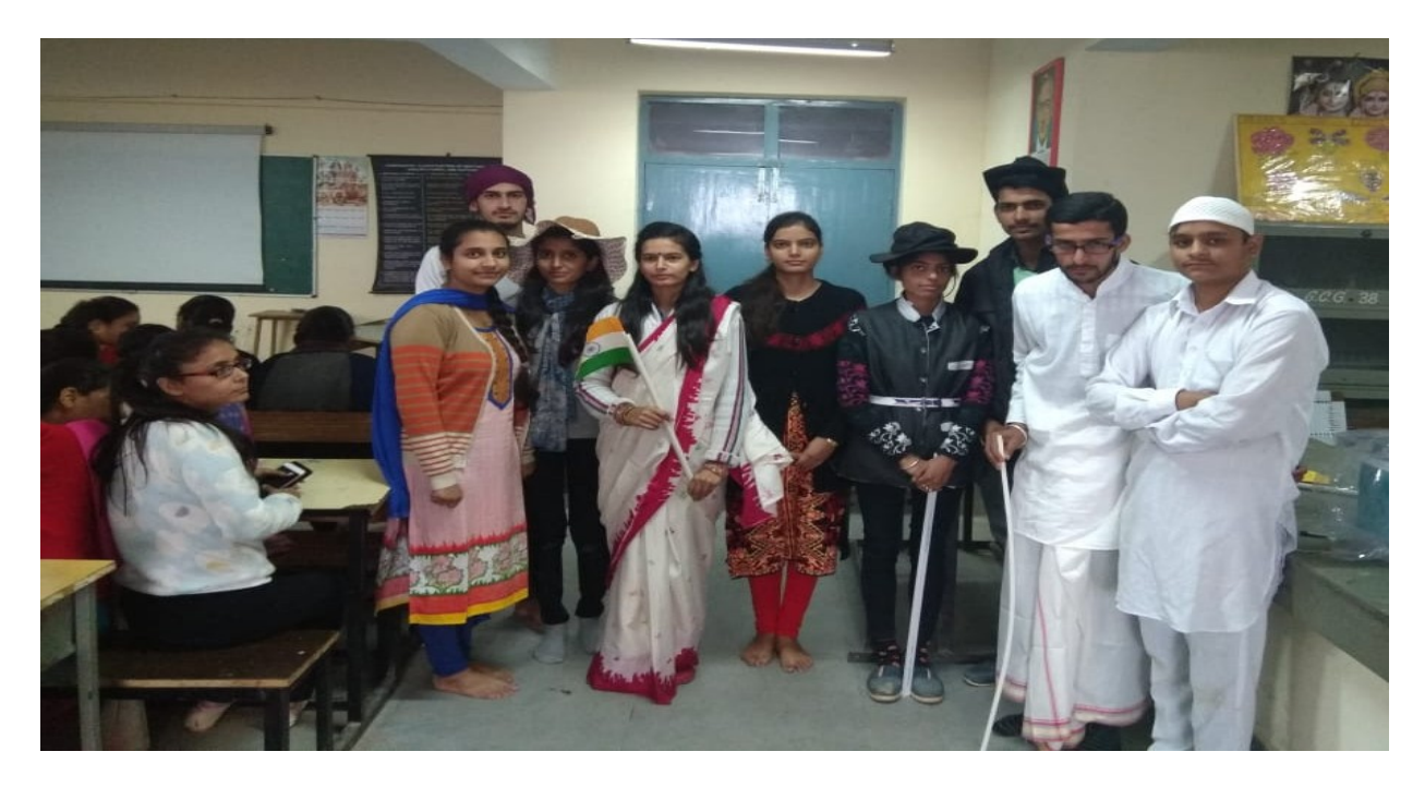
Figure 2 Communal Harmony Week Celebration