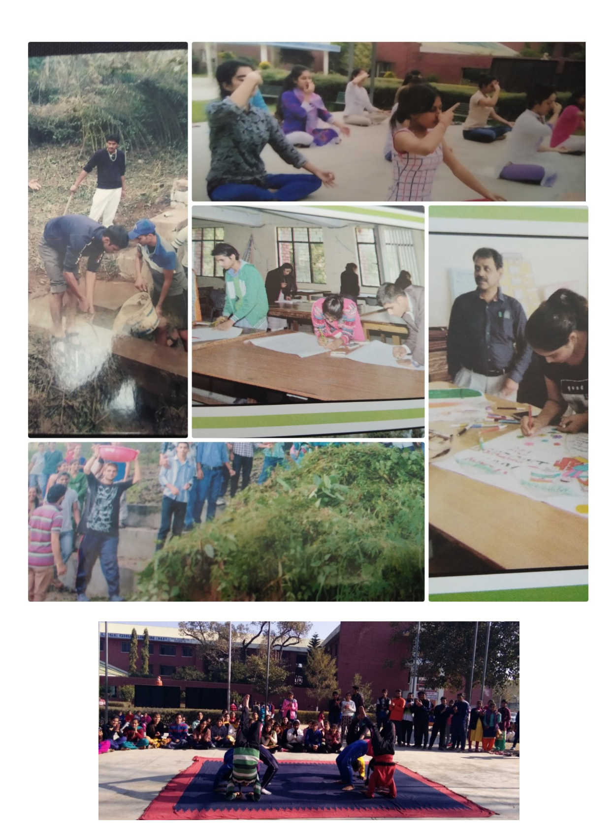
Figure 2 Glimpses of various activities