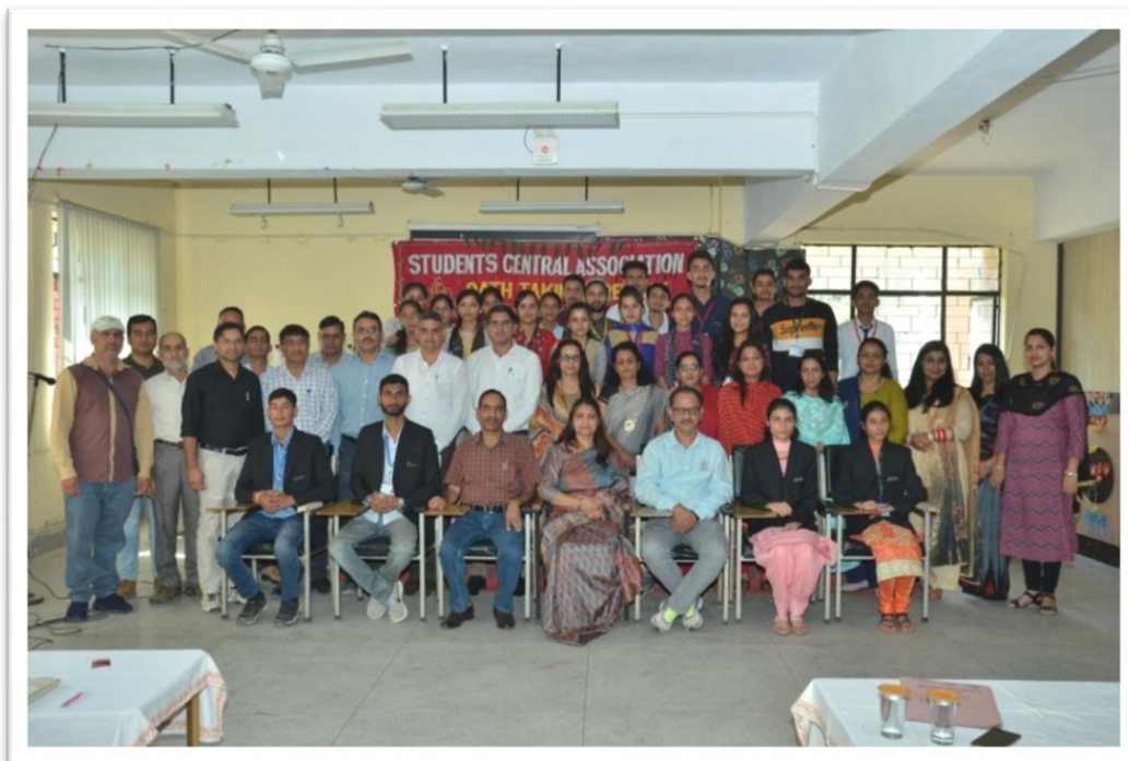
Figure 2 Oath taking Ceremony (Student Central Association)