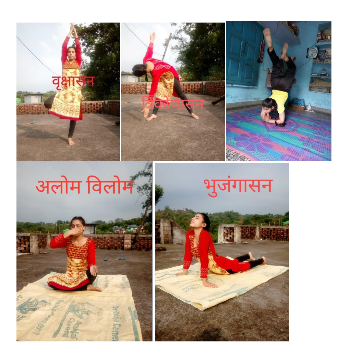
Students Performing Yoga