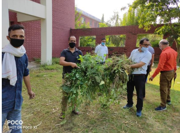
Cleanliness drive by College Staff