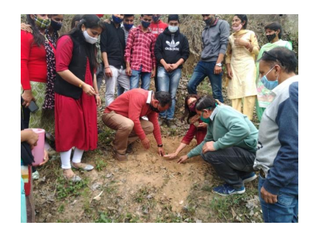
Plantation by staff and students