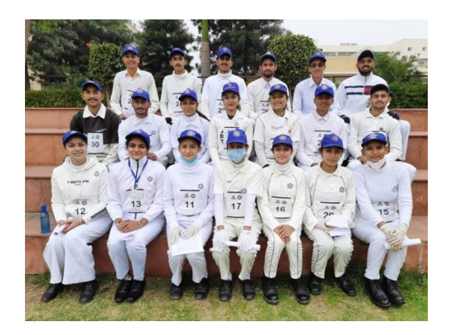
Participation of NSS students in National Camp at Chandigarh