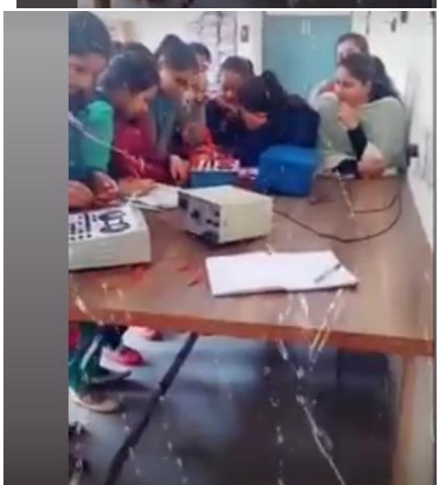
Lab Work by the students