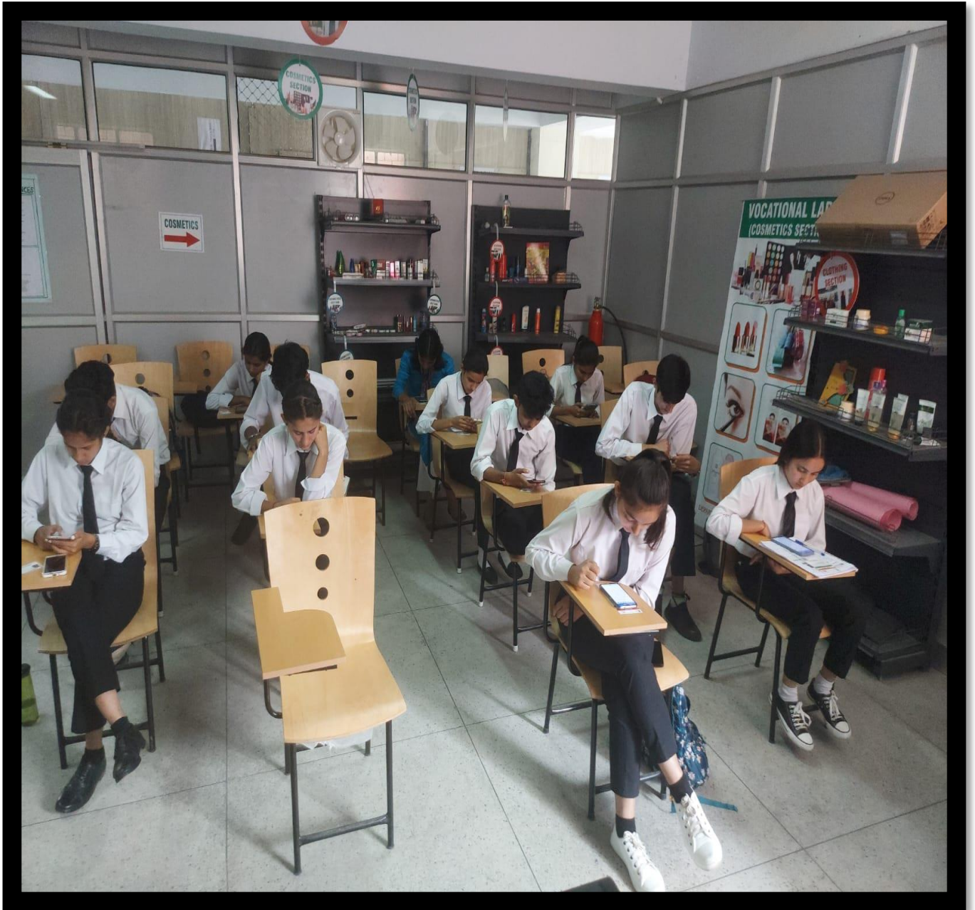
Glimpses of Introduction of industry and its roles and responsibilities in Reliance Trends (Kangra)