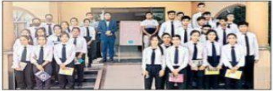
भ्रमण पर गए छात्र।