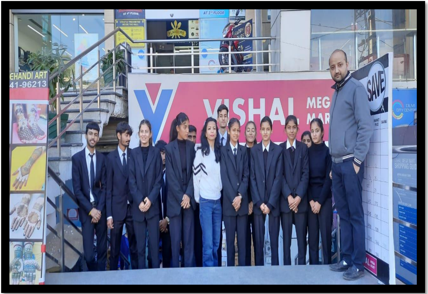
Glimpses of Skill-Assessment of Students (Retail Management)