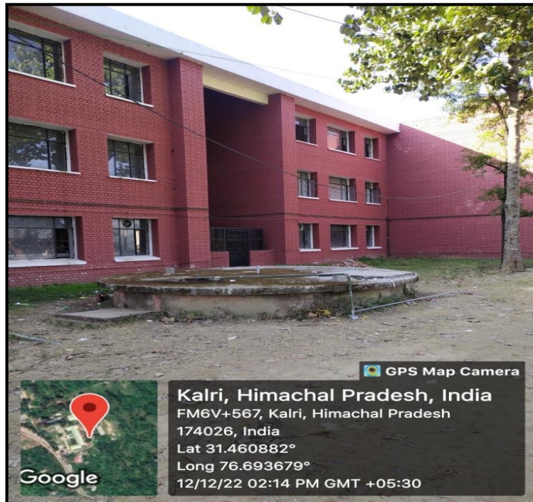
Rain water harvesting tank