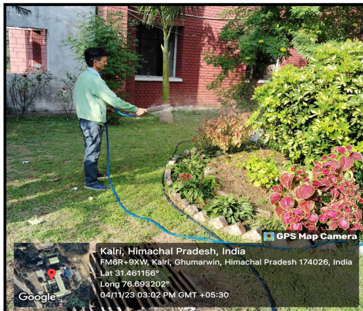
Use of Harvested Rain Water