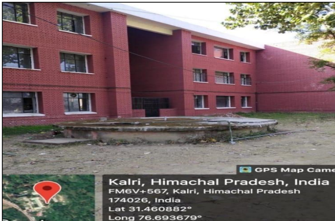
Rain Water Harvesting Tank

Rain water harvesting is the most economical and best way to use rain water. Our College has rain water harvesting system. Rain water is collected from the roof through collection pipes which are routed to rain water harvesting Tank. The harvested rain water is used for the plants of College garden and potted plants. During water scarcity this water is also used in toilets.