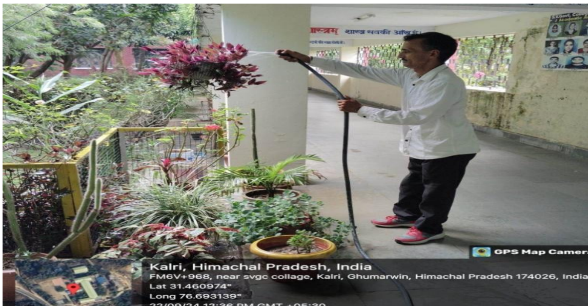
Use of Harvested Rain Water for potted Plants