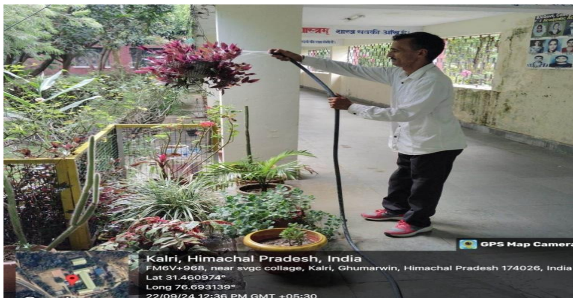
Use of Harvested Rain Water for potted Plants